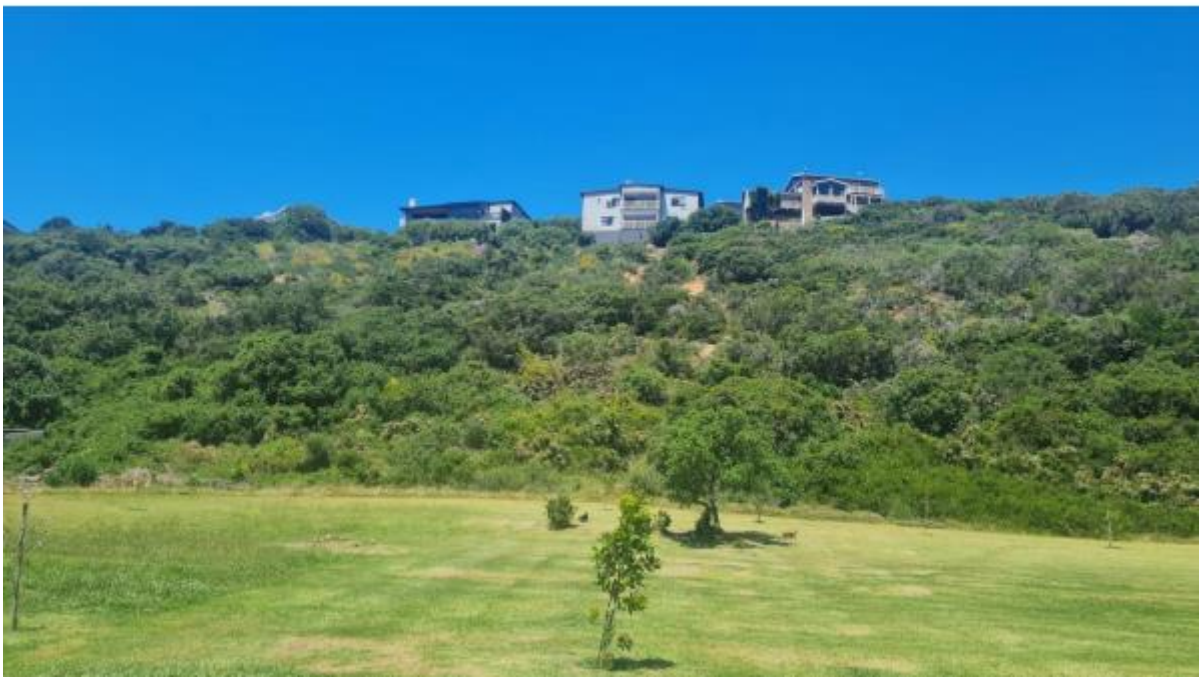
Alternative 1b: Construction of a new pumpstation, that will replace the existing cricket field pumpstation, right next to the cricket field pumpstation in the same locality as Alternative 1a (1st Photo) excluding the addition of one smaller pumpstation on Erf 111.

Alternative 2: Construction of a new pumpstation, that will replace the existing cricket field pumpstation, right next to an open piece of land adjacent to the Great Brak River Sports Club tennis courts (Below 3<sup>rd</sup> Photo).