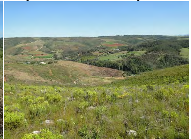
Photos 11-13 (left-to-right): Modern dwelling situated on study area; levelled terrace on higher-lying portion of property; long-distance view across the southern portion of study area.