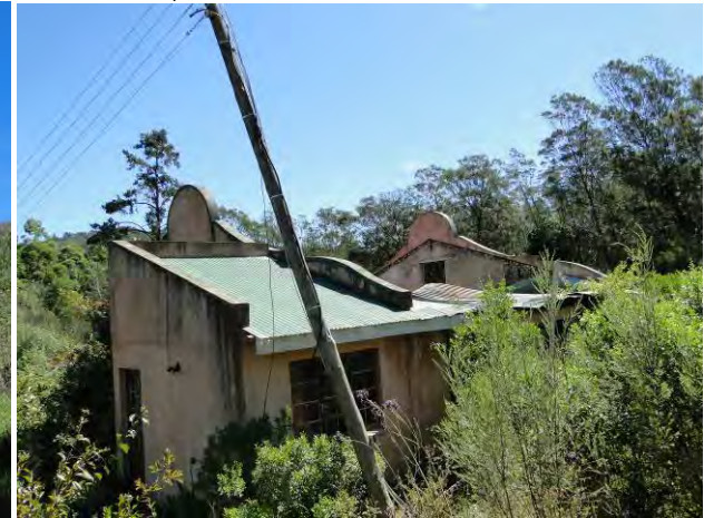
Photos 8-10 (left-to-right): New dam and fire-damaged historic building; Close-up views of south and north-facing elevations of same historic building.