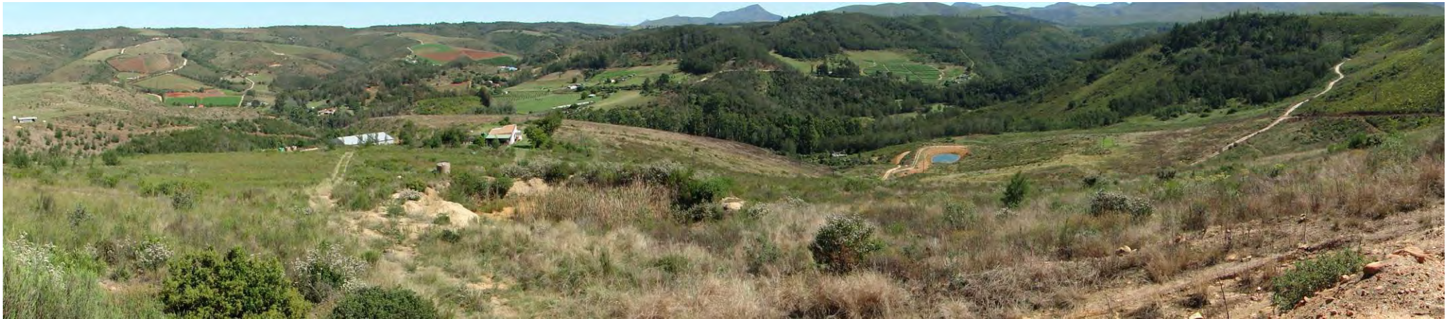
Photo 4: Long-distance southwest-facing view across the study area. Two modern structures (dwelling and outbuilding) visible to left, middle-ground.