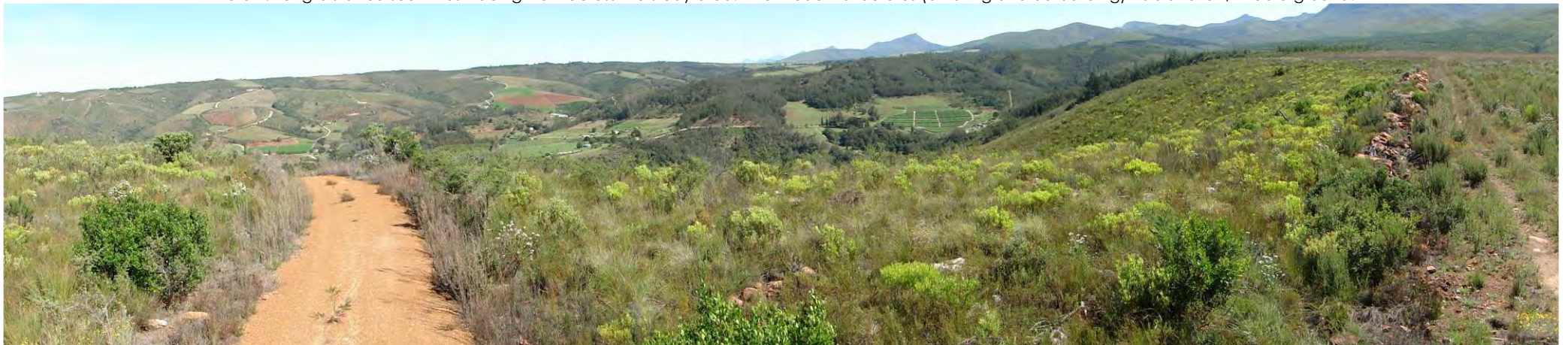
Photo 5: South-facing view across from upper portion of the study area.