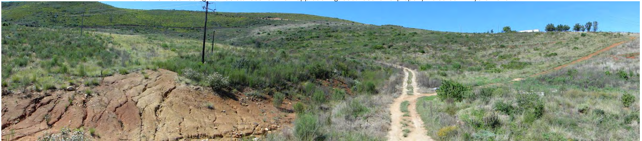
Photo 2: East-facing panoramic view of lower portion of the study area.