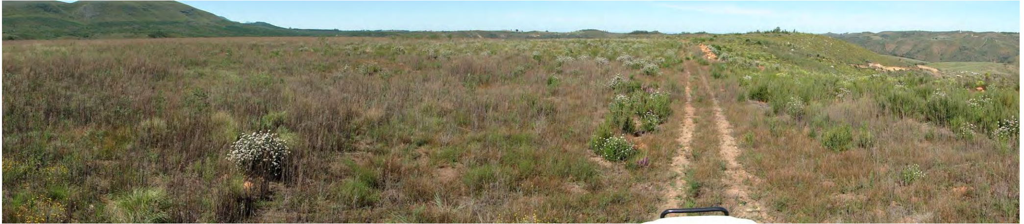
Photo 7: South-facing view across higher-lying plateau, which is the northern portion of the study area.