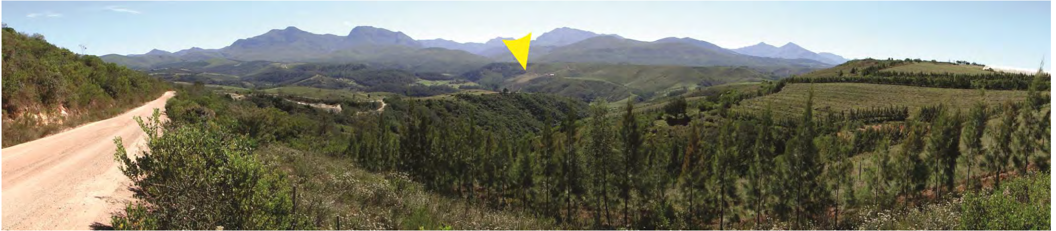
Photo 1: Northeast-facing view across Leeukloof from approaching road. Location of property indicated with yellow arrow.