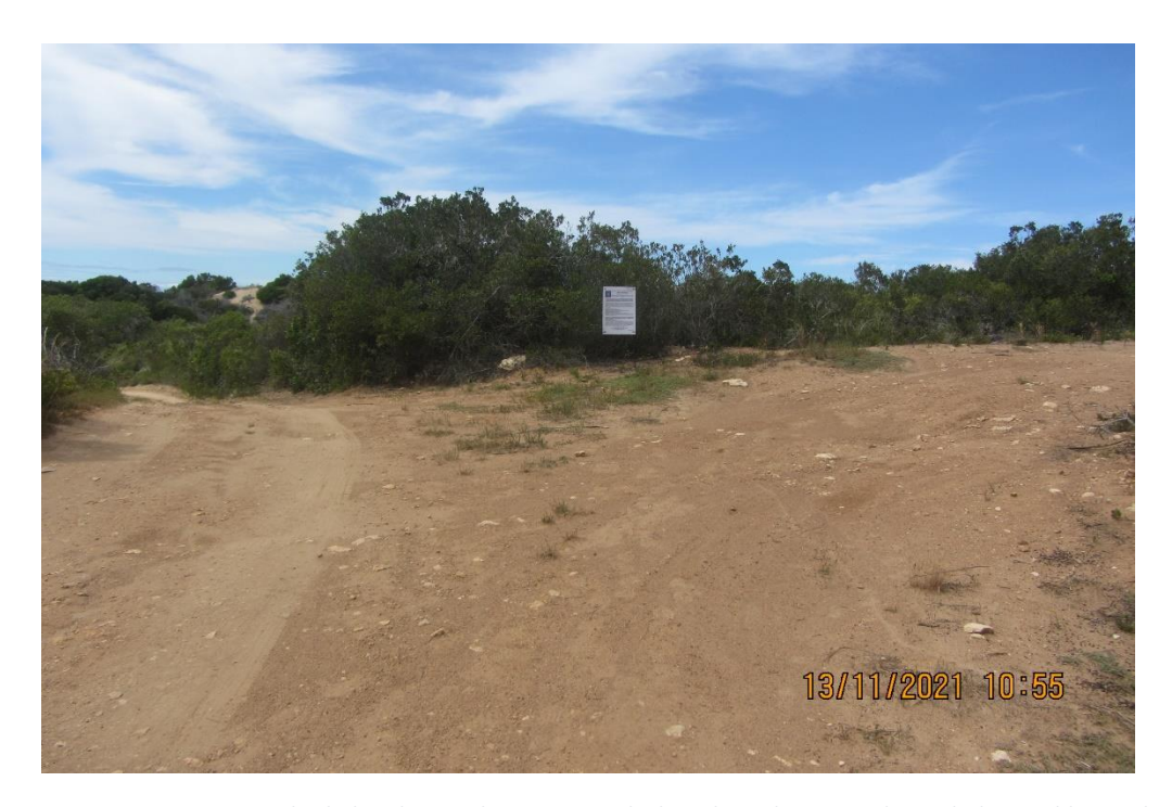
Figure 1: Site notice at road split heading to the property which is along the servitude road, thus visible to other residents/visitors from the greater Fransmanshoek Conservancy area and Management.