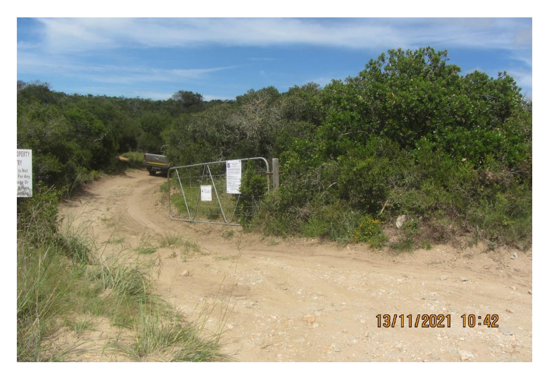
Figure 3: Notice at main gate entering greater Fransmanshoek Conservancy area onto the servitude road which is visible to the general public.