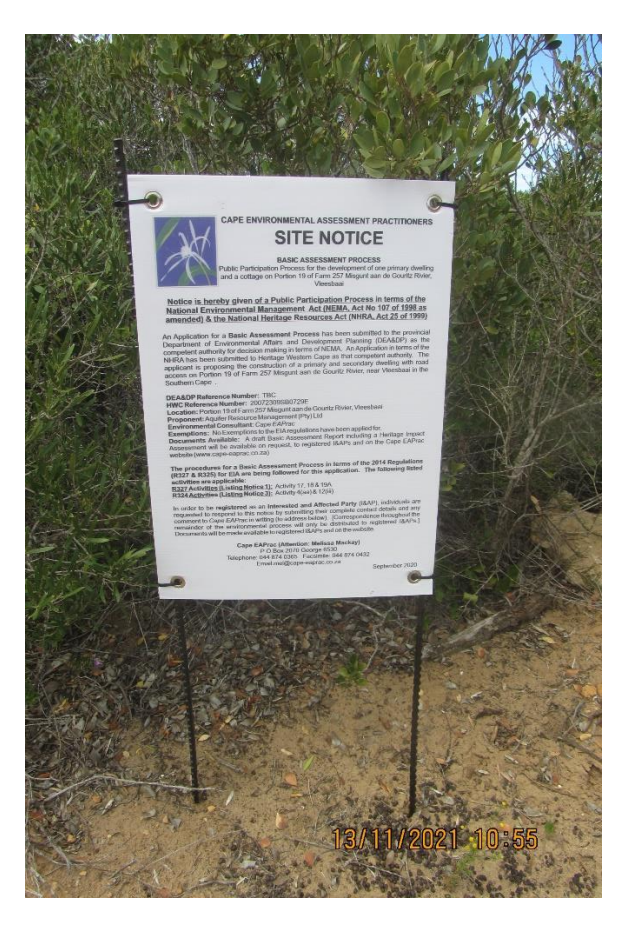
Figure 4: Site notice, not visible to the general public unless they have 4x4 vehicles.