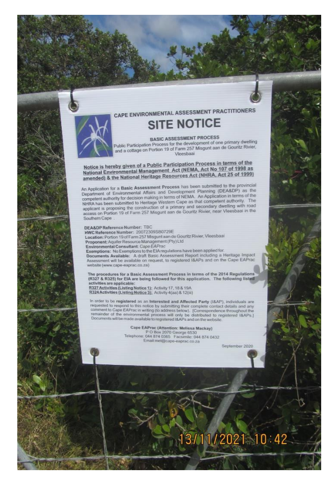
Figure 2: Notice at main gate leading to site which is not accessible to the public unless by 4x4.