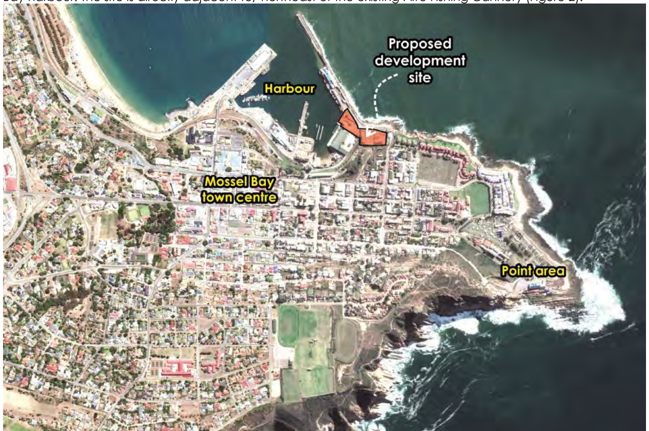
Figure 1: Location of study area within broader urban context (CapeFarmMapper 2019, as edited)

The proposed development site is essentially the area formerly utilised as part of the I&J Factory (closed during October 2012). The site was put out on tender for commercial / industrial use by the Transnet National Ports Authority (TNPA) as owners of the entire harbour facility. Afro Fishing (Pty) Ltd was awarded the tender to develop the property as per the Transnet National Port Authority's (TNPA) future planning goals for the Mossel Bay harbour. The site is directly adjacent to/ northeast of the existing Afro Fishing Cannery (Figure 2).