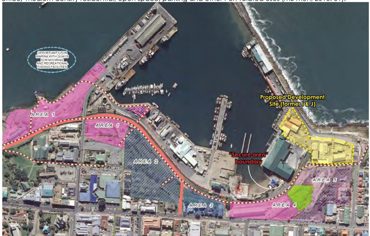
Figure 5: Extract from MB Central Precinct LSP, 2013: Proposed development site (yellow) within "secure area", no spatial proposals (MB Mun, 2013)

The document refers to its study area as being the Mossel Bay CBD and Port areas. One of the primary aims of the LSP was to define spatial planning guidelines and objectives that would contribute to improved spatial integration between the CBD and Port area. Proposals to this effect included, inter alia , improved public accessibility to areas within the Port area that do not necessarily pose a security risk as well as release of ±8.5ha land within the TNPA for land uses such as tourism facilities and accommodation, business/ retail, office/ medium density residential, open space, parking and other Port-related uses (MB Mun, 2013: 51).