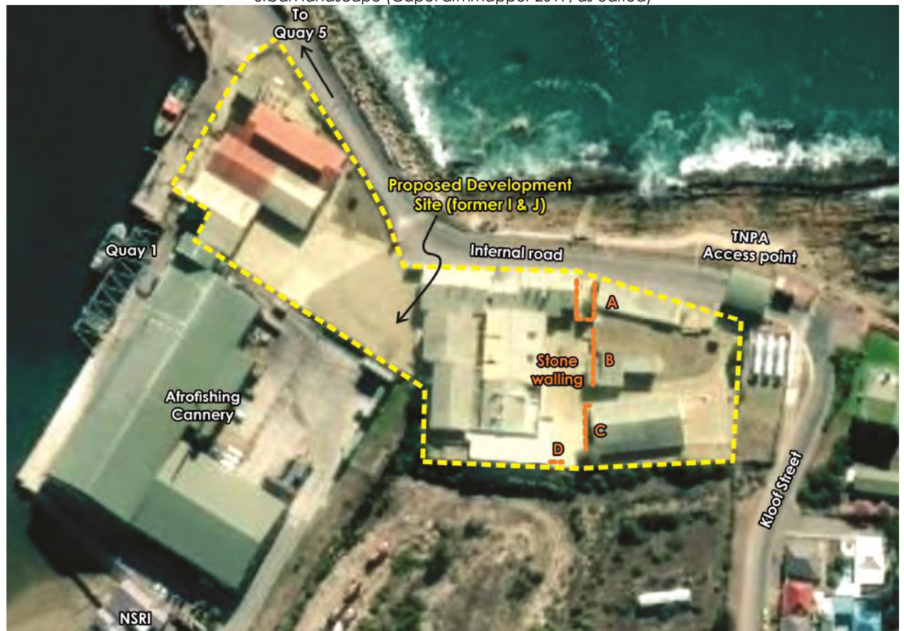
Figure 3: Proposed development site in relation to direct environs. Note location of stone walling (A – D) (CapeFarmMapper 2019, as edited)