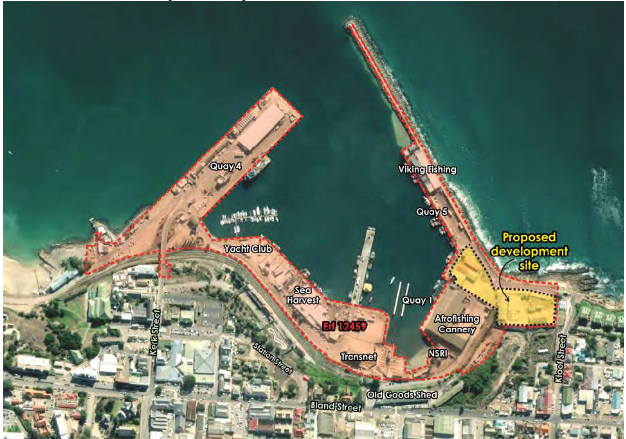
Figure 2: Proposed development site boundary shown within context of Erf 12459 cadastral boundaries and surrounding urban landscape (CapeFarmMapper 2019, as edited)

controlled Kloof Street harbour access point. Similar to buildings on the western portion of the site, most structures were found to be vacant, stripped of most internal fittings and in a derelict state. Vegetation growth was noted in between buildings. All buildings were found to be of modern construction.