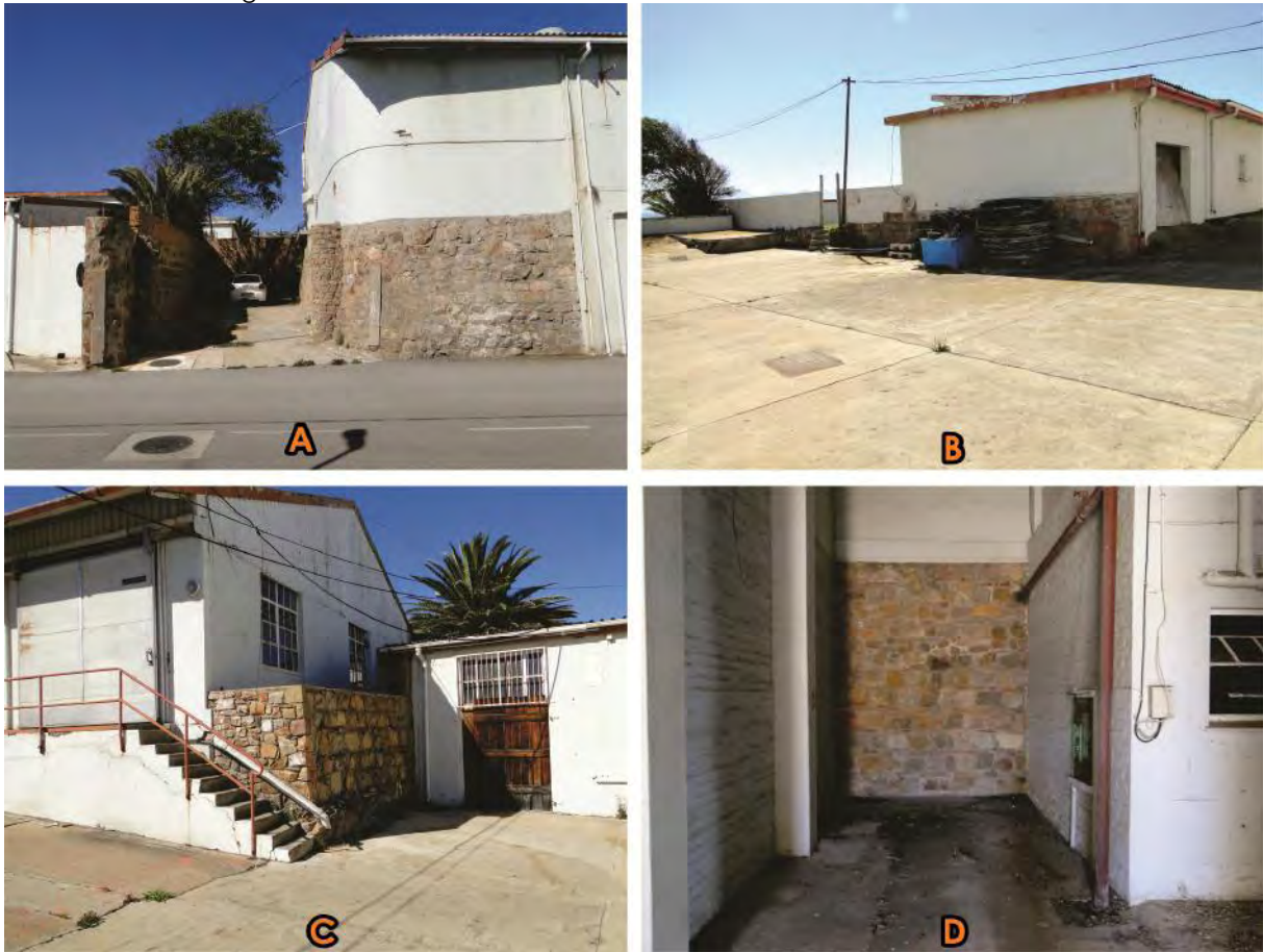
Figure 4: Images of four stone wall sections constructed of undressed stone – respective locations noted in Figure 3. Age could not be determined. Not considered significant.

Sections of stone walling constructed using undressed, roughly hewn stone were noted in between buildings on the western portion of the site ( Figures 3, 4 ). Some of the stone walls (A, B) had clearly been altered/ added onto. Another section of stone walling serves as plinth to a modern structure. The date of construction of the sections of stone walling could not be determined.