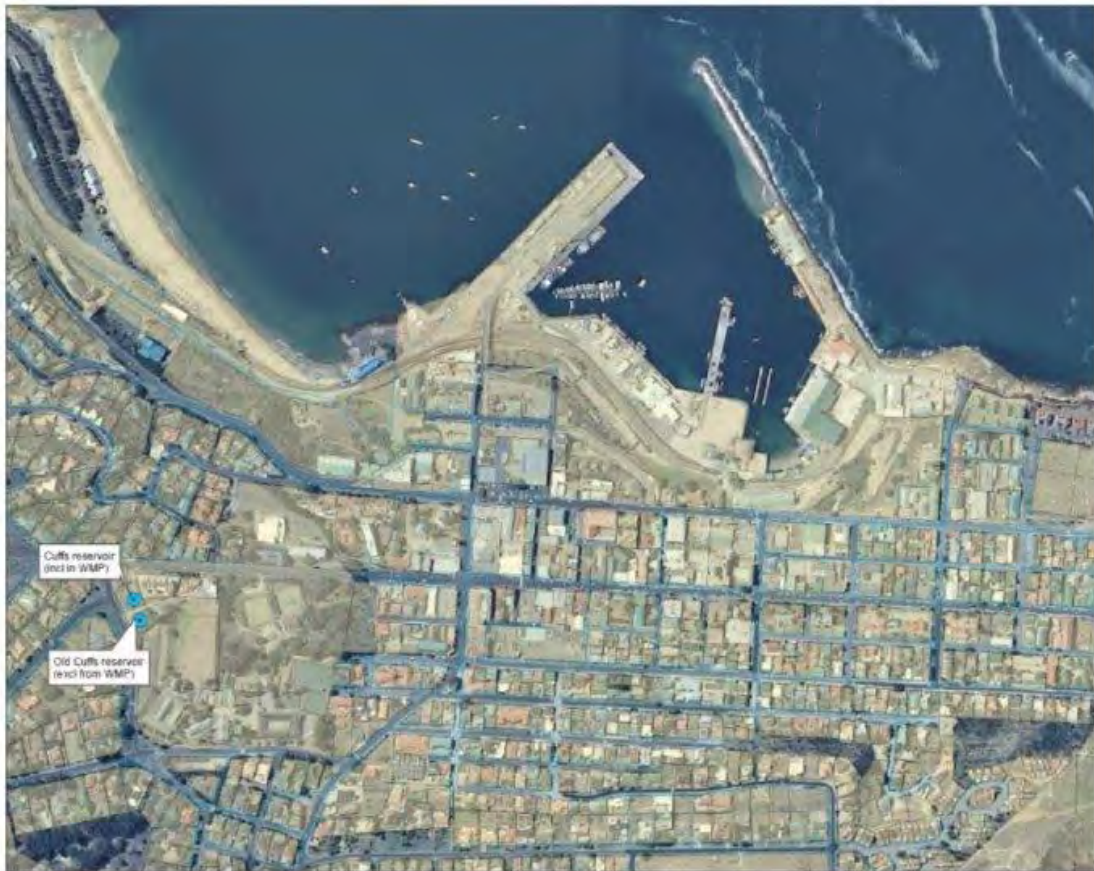
Figure 03: Bulk water network to the Port and CBD areas.

The existing bulk/external water network is shown in Figure 03 hereunder.