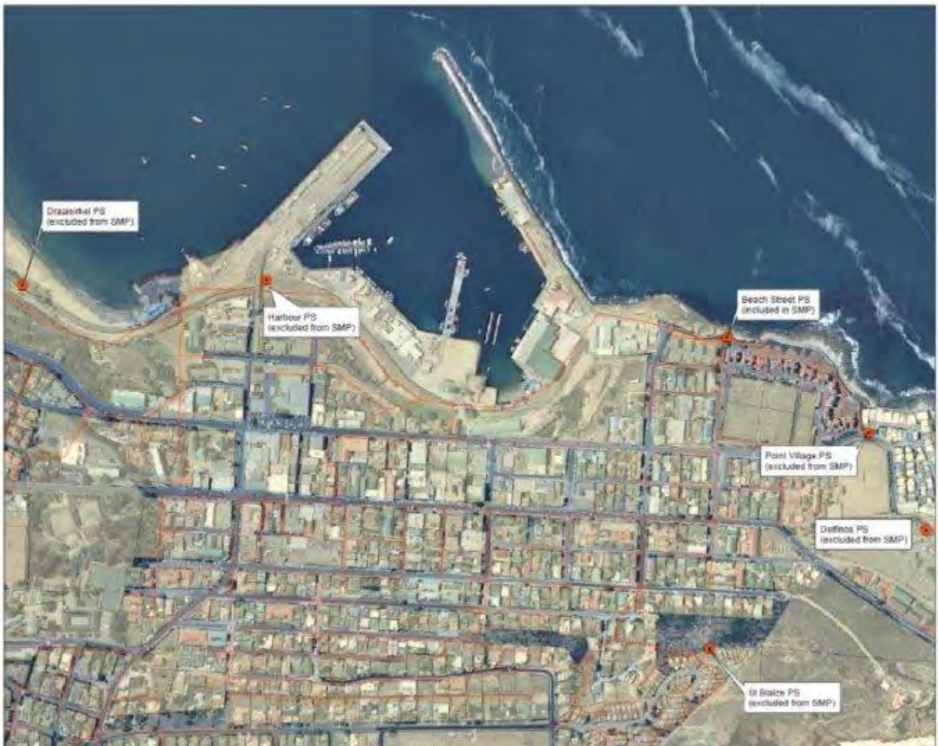
Figure 04: Bulk sewage network for Port and CBD areas

The existing bulk/external sewage network is shown in Figure 04 hereunder.