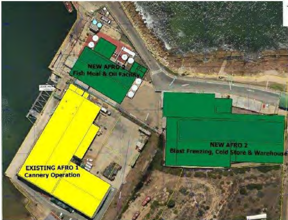
Figure 02: Proposed Site Development Plan

The proposed expansion development is on the site of the old I&J Fish facility.