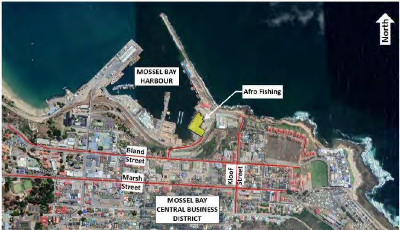
Figure 01: Locality Plan

The proposed Location- and Site Development Plans are attached hereunder as Figures 01 and 02.