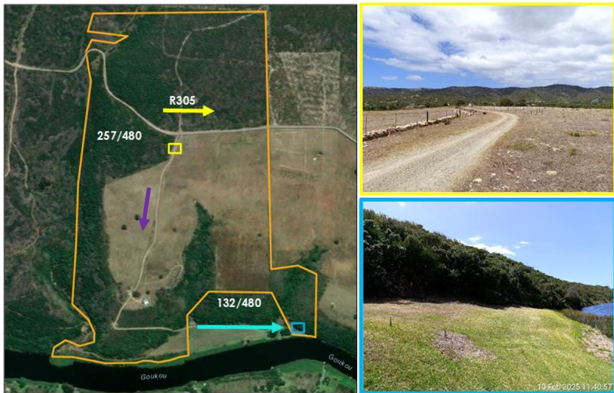
Figure 2: The existing gravel road continues south in the general direction of the Goukou River (yellow box) (purple arrow), where it traverses the neighbouring Portion 132/480 (light blue arrow) towards the preferred locality of the primary dwelling (blue box).

The proposal entails the following development components (Figure 2)(Figure 3):