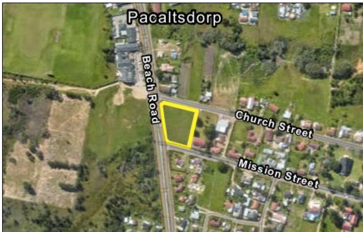
Figure 1: Locality map of proposed development site on Erf 7379, Pacaltsdorp, George.

Cape EAPrac has been appointed as independent environmental consultants responsible for facilitating the environmental investigation and formal Basic Assessment process for the proposed filling station and associated infrastructure on Erf 7379 in Pacaltsdorp, George Municipality (Figure 1).