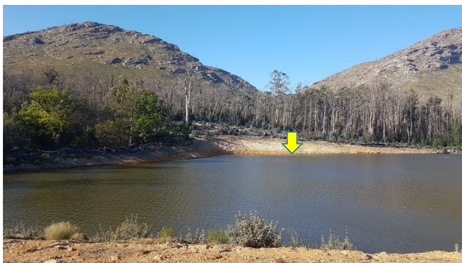
Figure 2: Excavation of fill for embankment material