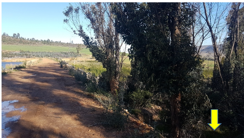
Figure 1: Old spillway downstream channel