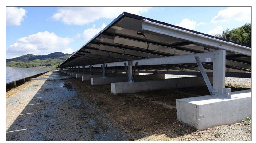
Figure 3: Cast Concrete Foundation

Various options exist for mounting structure foundations, which include cast/ pre-cast concrete (shown in Figure 3), driven/ rammed piles (Figure 4), or ground/ earth screws mounting systems (Figure 8).