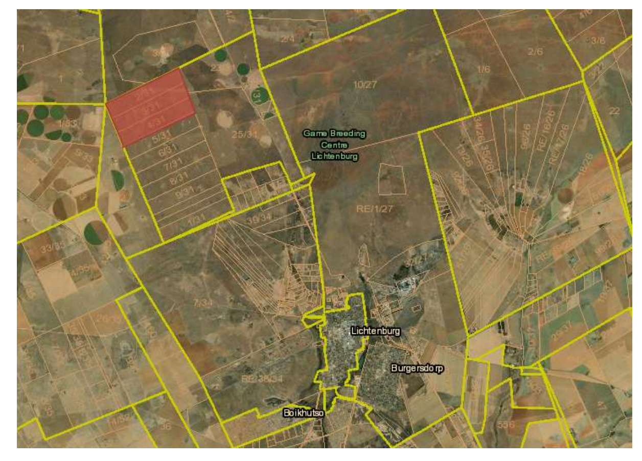
Figure 1: Houthaalboomen North PV Cluster Locality Map