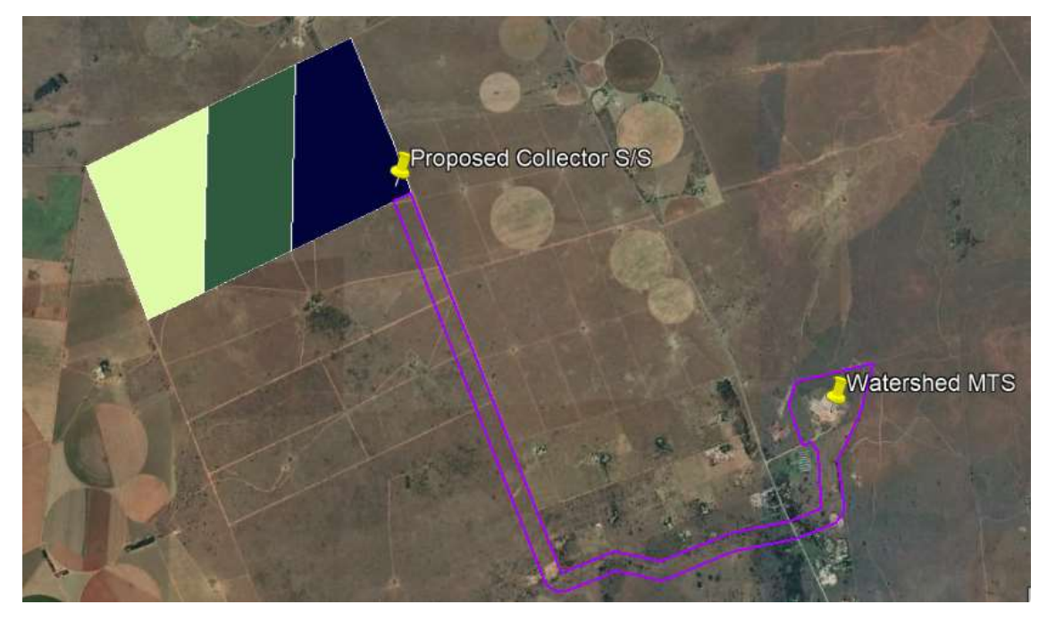
Figure 4: Houthaalboomen North Grid Corridor to Watershed MTS (approximately 8.5 km)

The grid connection corridor is located within a Strategic Transmission Corridor ("the Northern Corridor"), earmarked for the development of grid connection infrastructure, and will include the following infrastructure components: