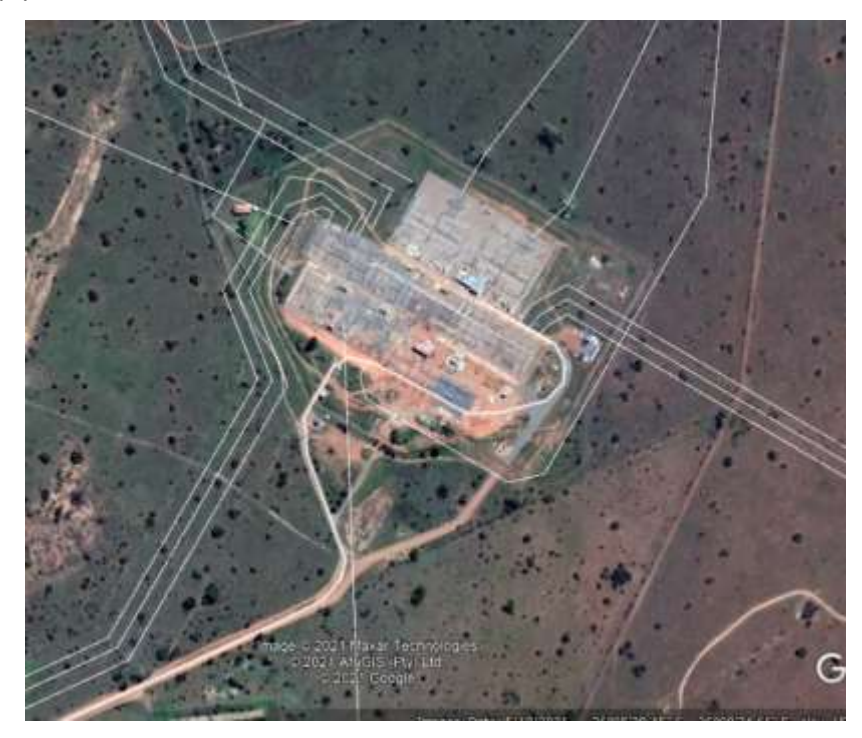
Figure 5: Connection to the existing Watershed MTS (Google Earth image)