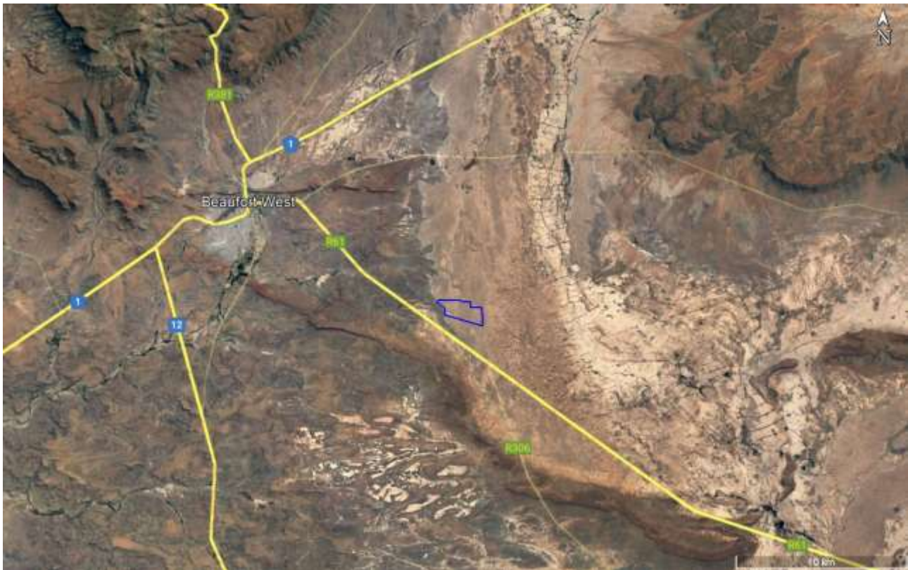
Figure 1. Locality map of the proposed PV facility, south-east of the town of Beaufort West.

Environmental authorisation is being sought for the Bulskop PV solar energy facility, near Beaufort West, Western Cape (see location in Figure 1). In terms of the National Environmental Management Act (Act No 107 of 1998) (NEMA), an application for environmental authorisation requires an agricultural assessment. In this case, based on the verified sensitivity of the site, the level of agricultural assessment required is an Agricultural Compliance Statement.