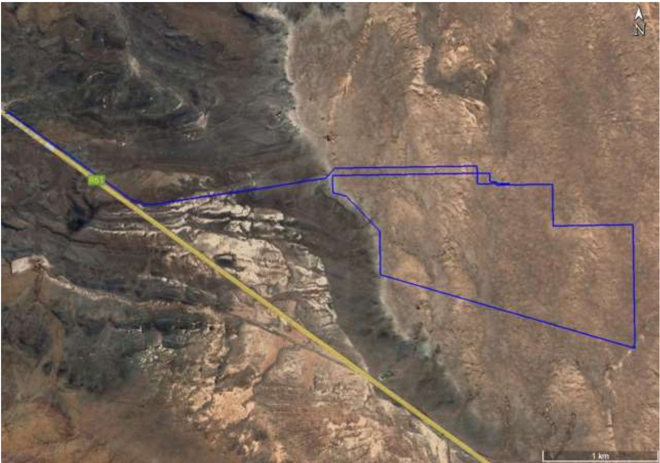
Figure 3. Satellite image map of the agricultural footprint of the proposed development.

This site sensitivity verification verifies the entire site as being of less than high agricultural sensitivity (a maximum land capability value of 7). The required level of agricultural assessment is therefore confirmed as an Agricultural Compliance Statement.