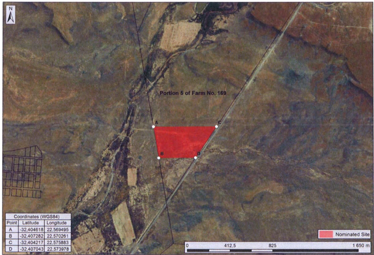
Figure 1: Grid connection corridor route in respect of Hans Rivier being Portion 5 of Farm No.169.