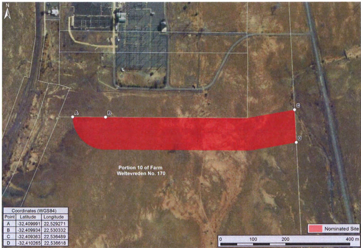
Figure 1: Grid connection corridor route in respect of Portion 10 of the farm Weltevreden No. 170.