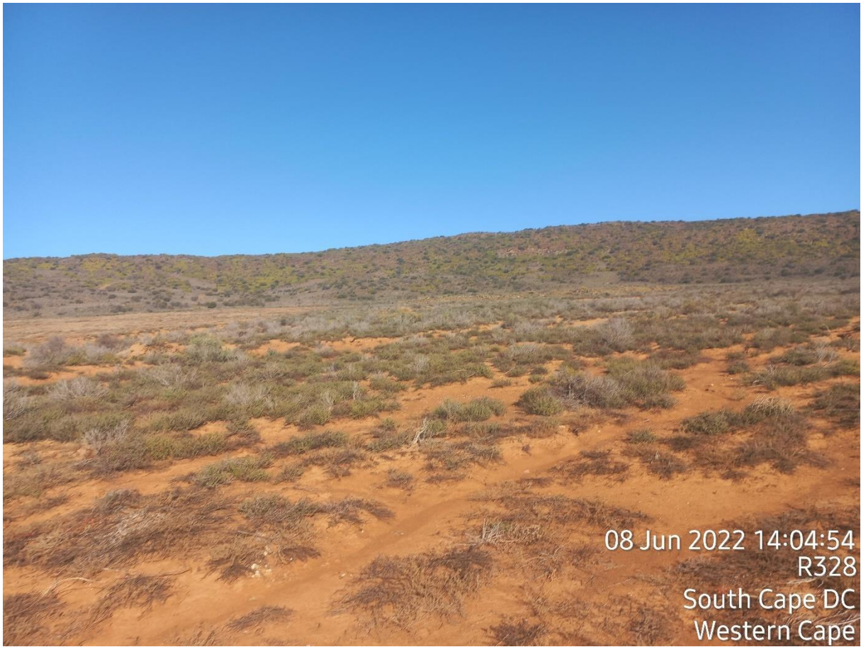
| Figure 210: Image of the vegetation on site in 2022 outside of the proposed cultivation area.