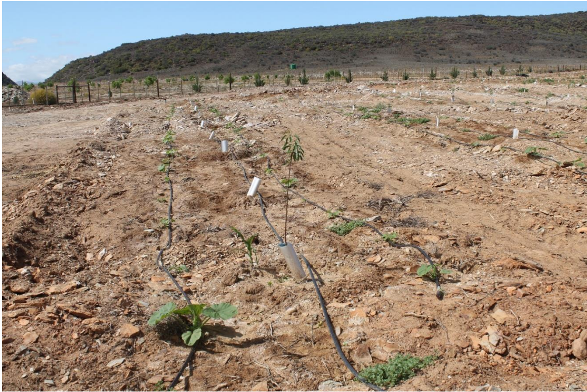
Figure 1: The cultivated area just after commencement of activities.