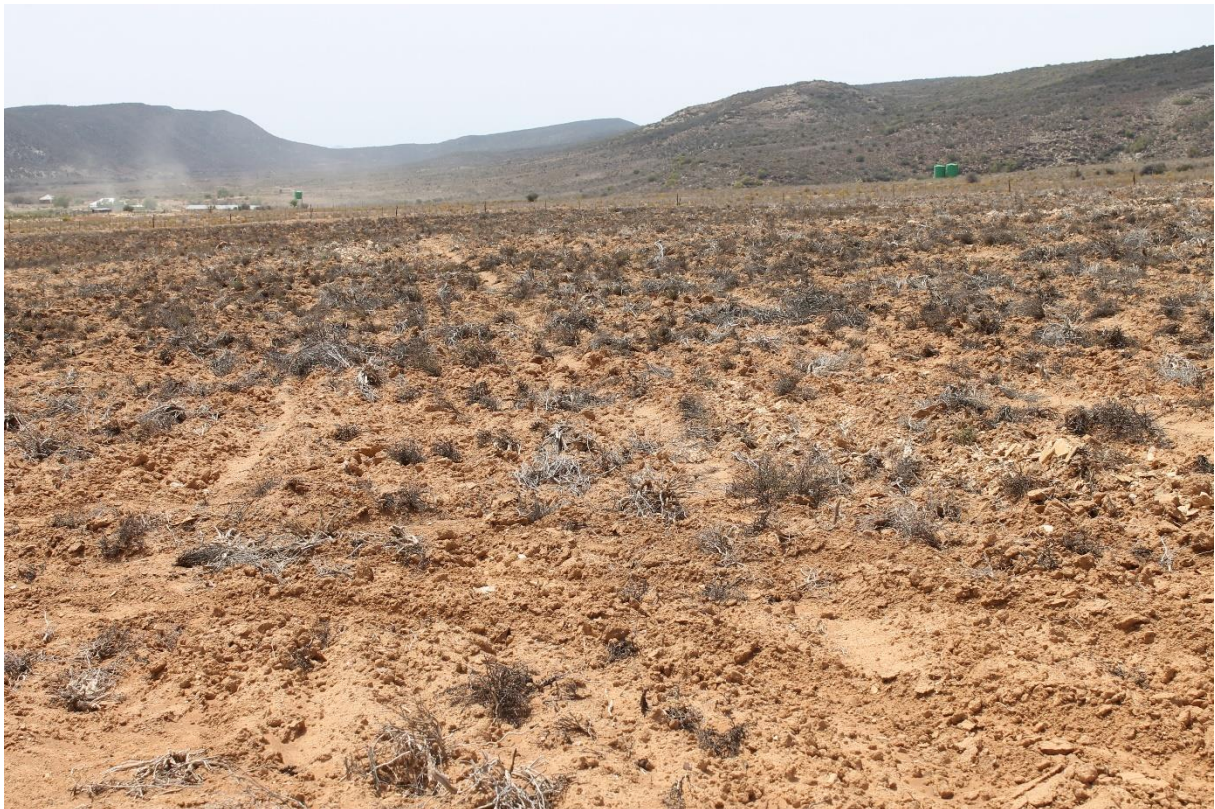
Figure 89: Image of the vegetation on site in 2020 outside of the proposed cultivation area.