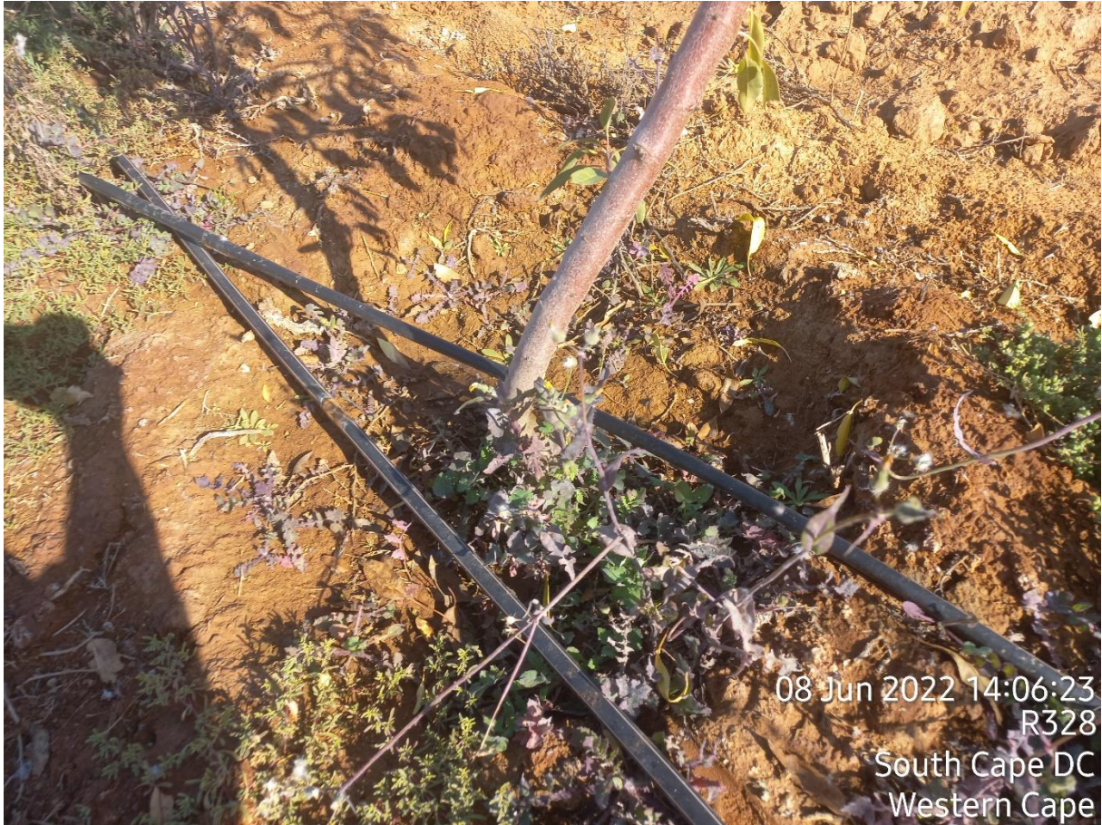
Figure 78: Drip irrigation on the site.