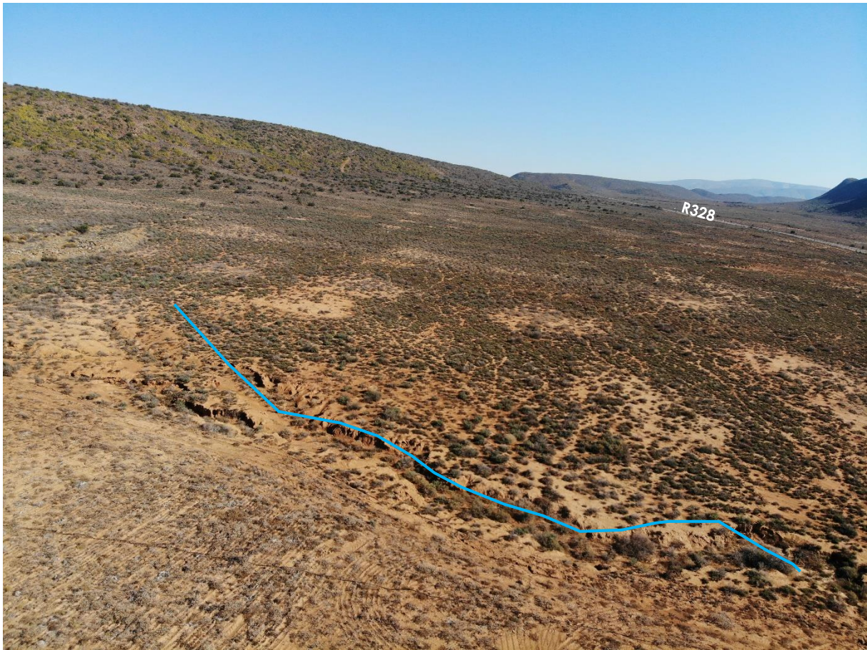
Figure 5: View of the most western drainage line within the proposed cultivation area creating the western boundary of the proposed cultivation area. Indigenous vegetation in the background but not of high sensitivity.