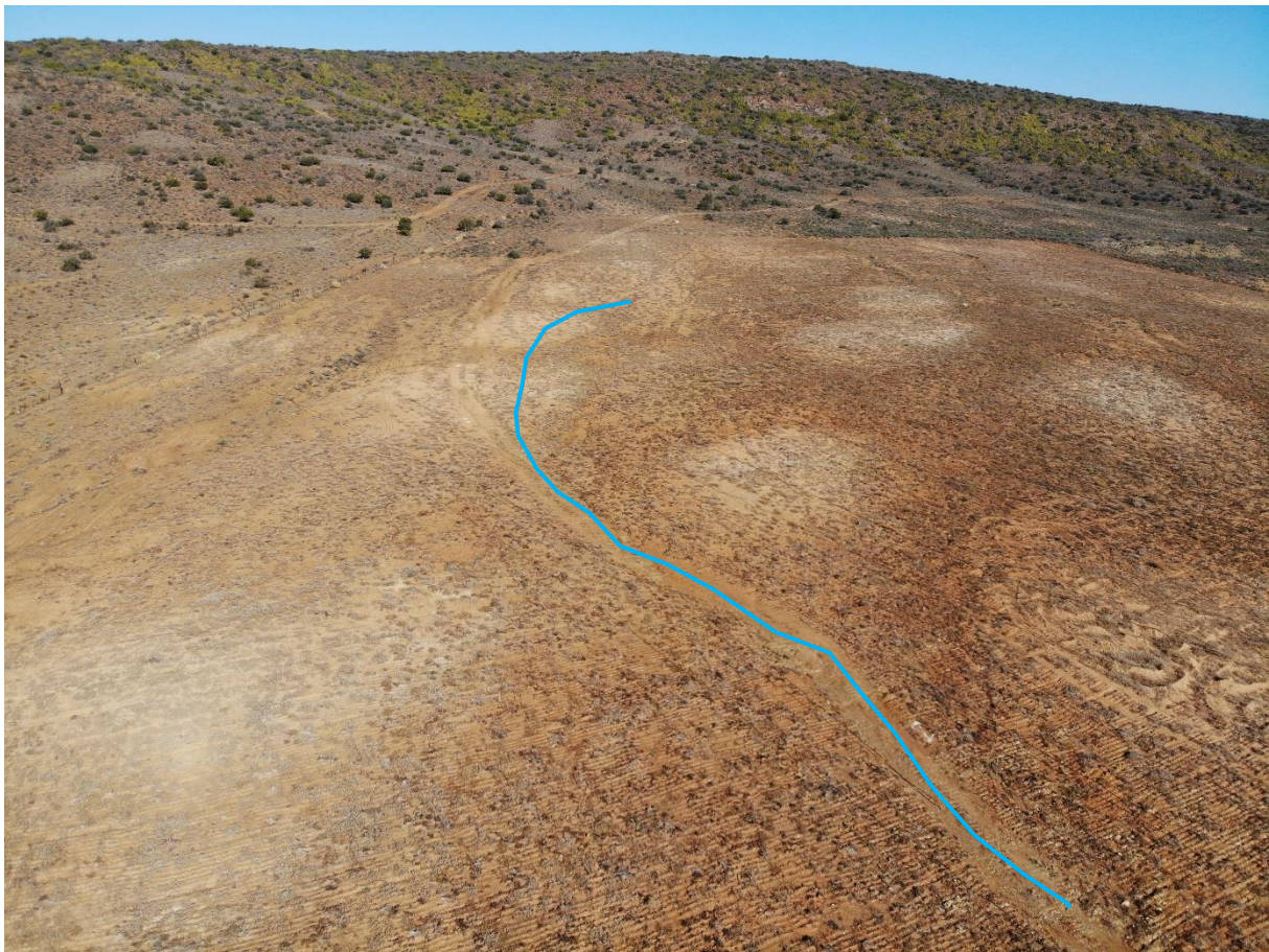
Figure 4: View of a drainage line (wash area) [blue line] into the proposed cultivated area.