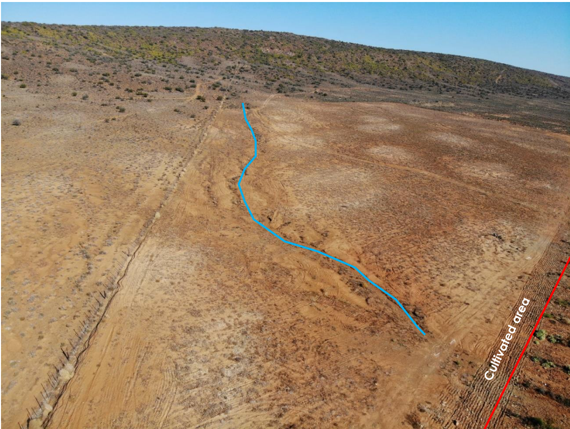
Figure 3: View of the drainage line (blue line) running through the ripped area entering the planted Zhending in the cultivated area.