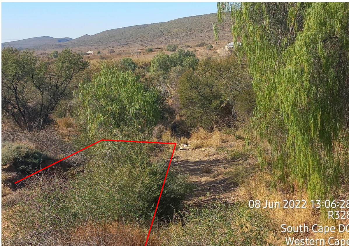
Figure 67: View of the area after the pipeline was constructed. the image shows the regrowth of vegetation within the disturbed area. The red polygon is where the northern bank was disturbed.