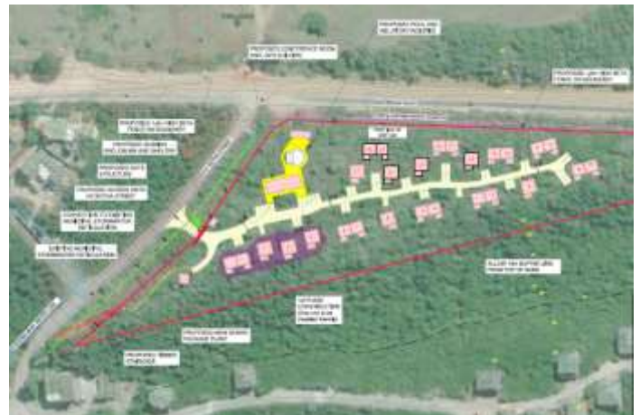
Fig. 1: Preliminary site development proposal