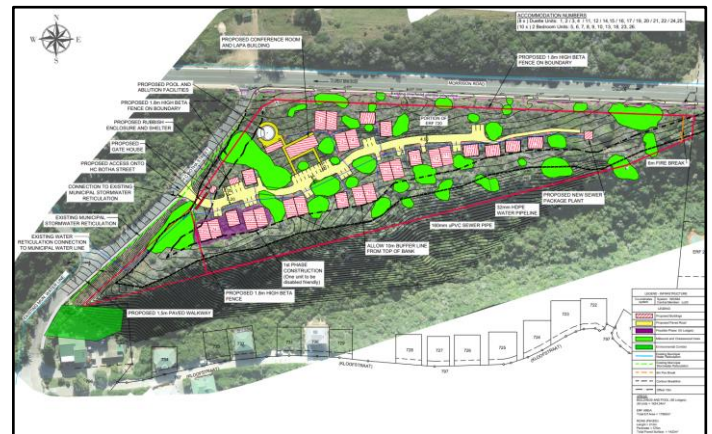
Figure 1: Preliminary Site Development Plan.

Erf 720 is located on the corner of Morrison Road and H.C. Botha Street.