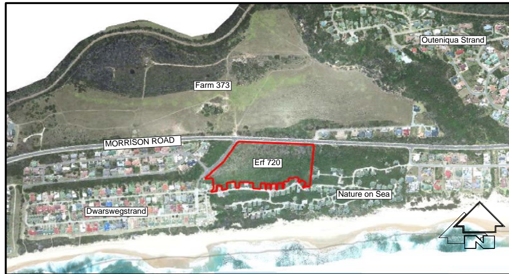
LOCALITY MAP: (True to scale)