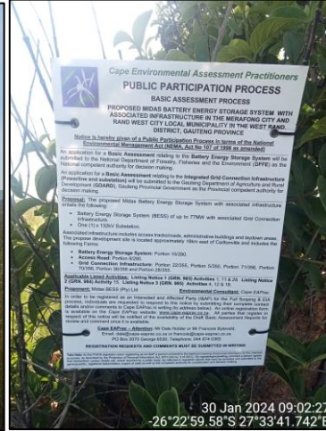
30 Jan 2024 09:02:27 -26°22'59.58"S 27°33'41.742"E