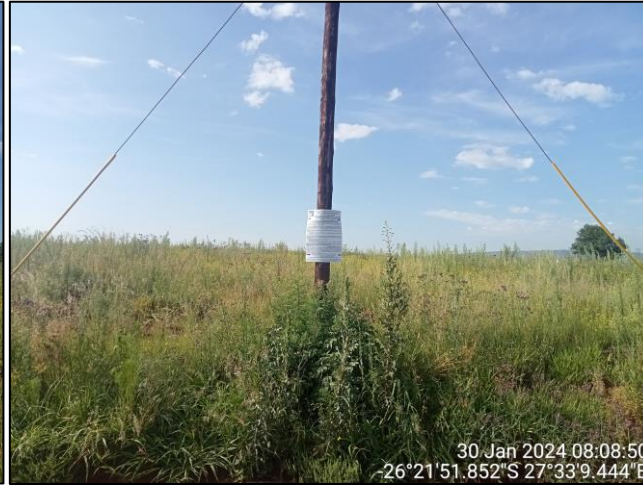
30 Jan 2024 08:08:50 -26°21'51.852"S 27°33'9.444"E