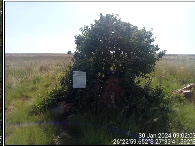
30 Jan 2024 09:02:03 -26°22'59.652"S 27°33'41.592"E