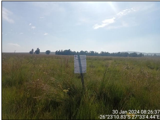
30 Jan 2024 08:26:37 -26°23'10.83"S 27°33'4.44"E