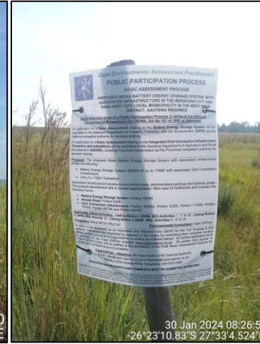
30 Jan 2024 08:26:51 -26°23'10.83"S 27°33'4.524"E