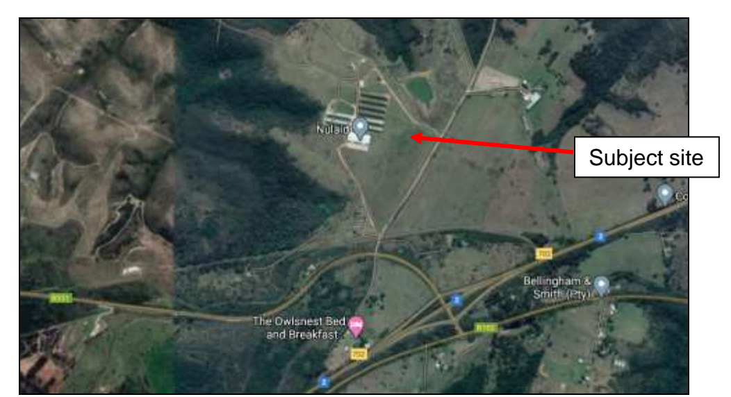
Figure 1: An extract from Google Maps indicating the access roads to the subject site.

The property currently gain access off the R331, which will remain unchanged. This road then gives good access to the Thornhill interchange on the N2 towards Port Elizabeth in the east and the Garden Route to the west.