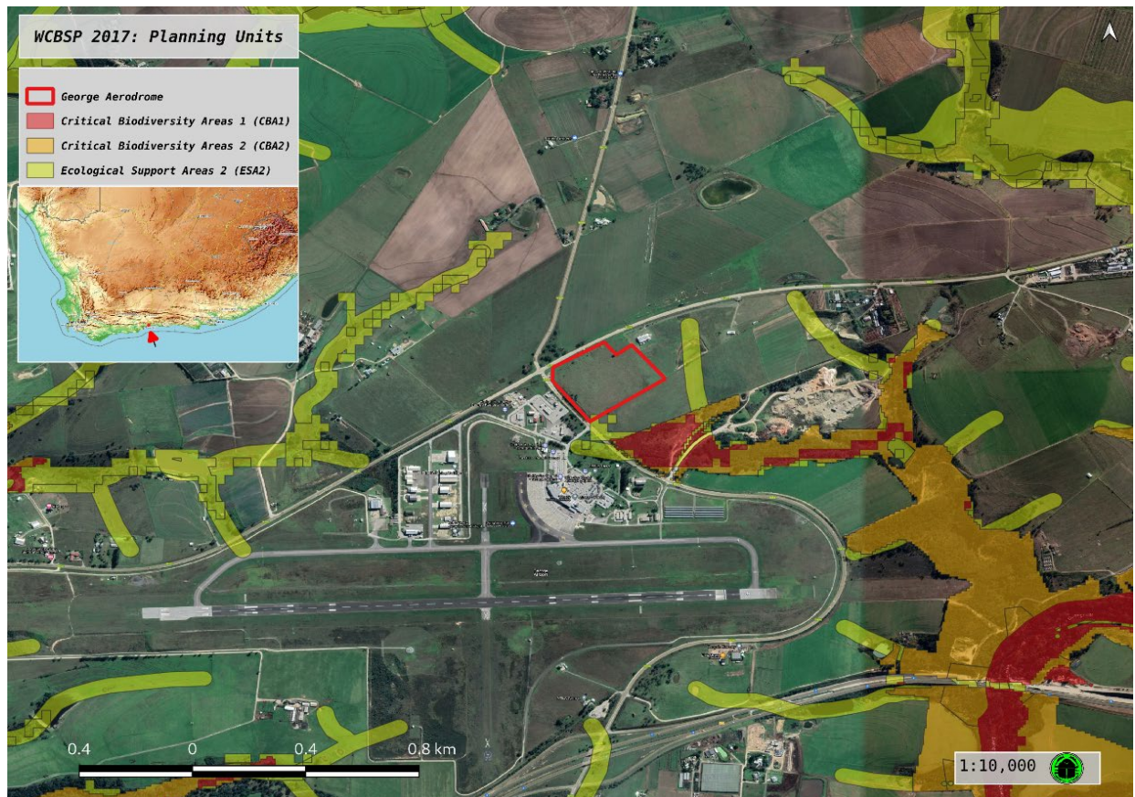
Figure 4: The George Biodiversity Sector Plan/WCBSP (2017) [1] delineation of Portions 130, 131 & 132 of 208, Gwayang and immediate surroundings.