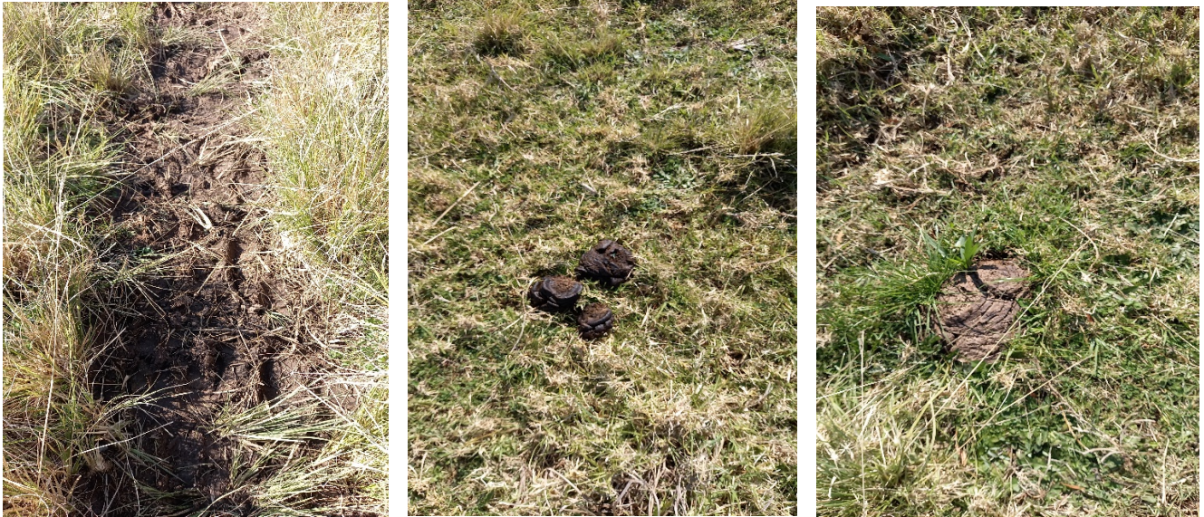
Figure 8: Livestock signs of various ages were present across the entirety of the site indicate that the site is being grazed regularly.