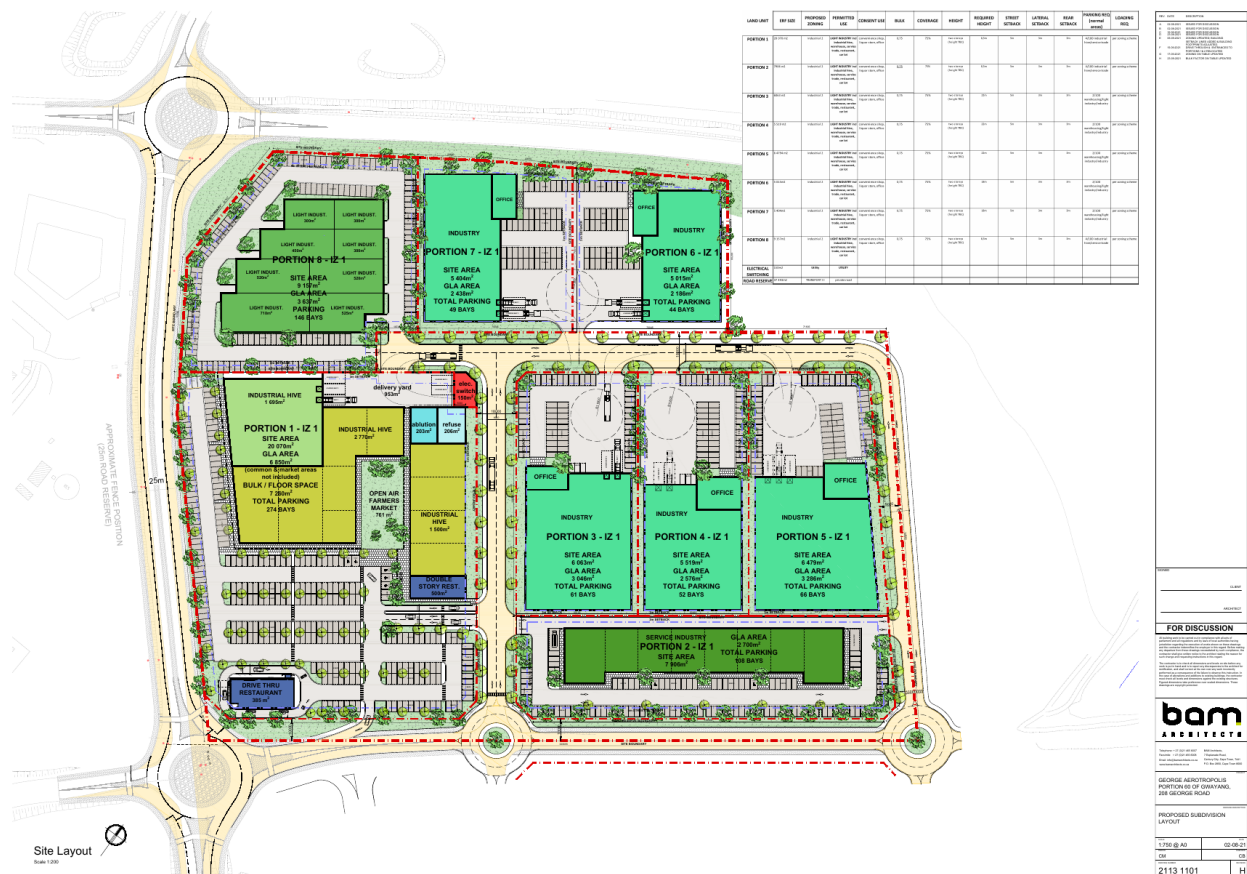
Figure 1: Lay-out plan for the proposed George Aerotropolis development.