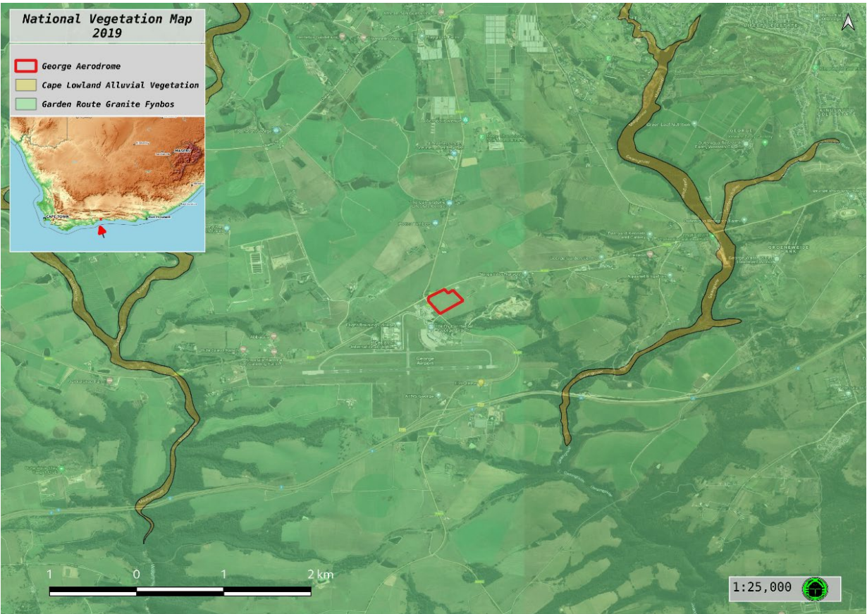
Figure 3: National Vegetation Map [3] delineation of Portions 130, 131 & 132 of 208, Gwayang and surroundings.