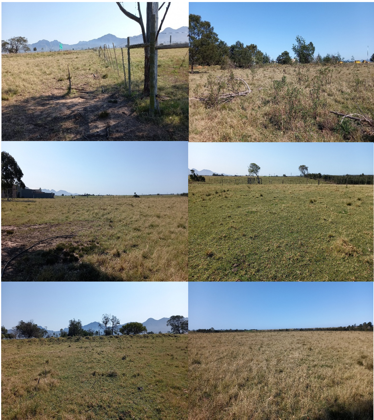
Figure 7: Photos taken of the site from different angles, showing the high level of degradation of the site due to intensive grazing. Pioneer and pasture grasses ( Pennisetum clandestinum , Cynodon dactylon , Lolium perenne ) are most abundant and Black Wattle ( Acacia mearnsii ) is encroaching on the edges of the site.