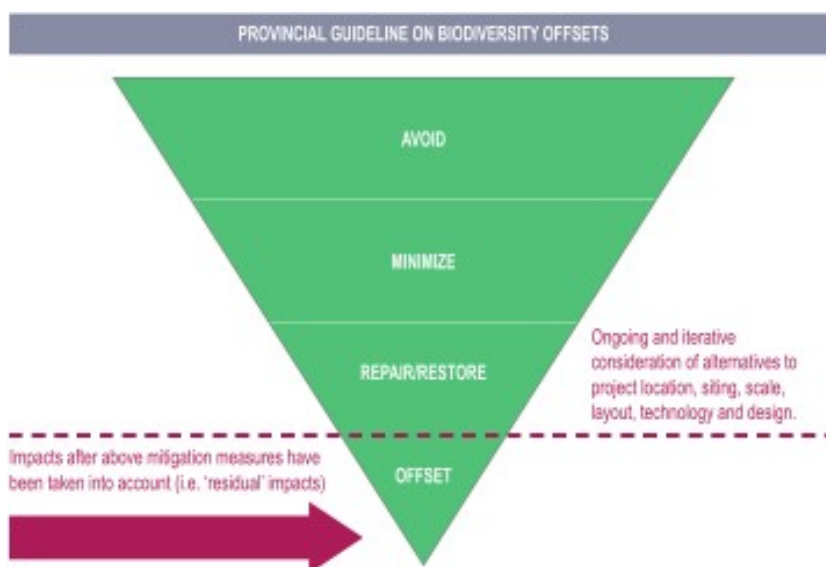
Figure 6: The Mitigation Hierarchy from WCBSP, 2017.

The identification of sensitive areas was primarily based on consideration of the current state of the proposed site and location of encountered sensitive species. This state includes the extent to which the area can currently be considered to function as it is designated in terms of reigning conservation plans (WCBSP in this case). Highly fragmented, degraded and transformed areas are considered in terms of the capacity, cost and urgency for active restoration action to be applied to regain that biodiversity function. This methodology considers the mitigation hierarchy [1] as guideline (see Figure 6).