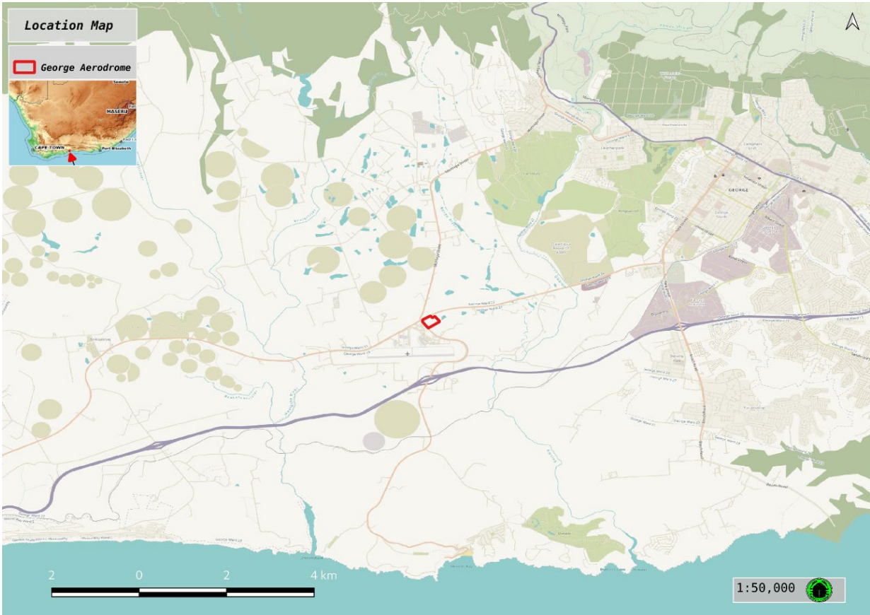
Figure 2: Location of Portions 130, 131 & 132 of 208, Gwayang and surroundings.